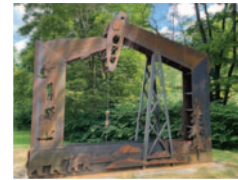
Another intriguing display was the Titusville Oil History Wall. Very creative.