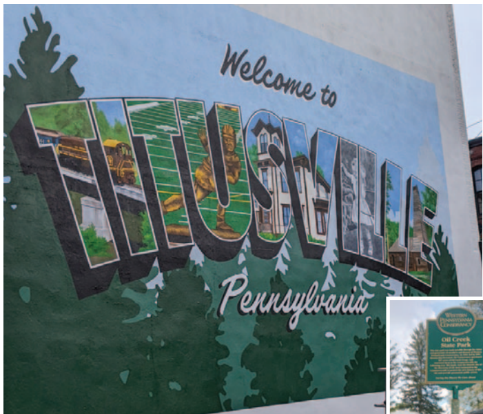
So much history to soak up at Titusville and surrounds! Oil Creek State Park, the very impressive Drake Well Museum with film and park, Pithole City (Oil's Vanished Boomtown, 1865-1877)...