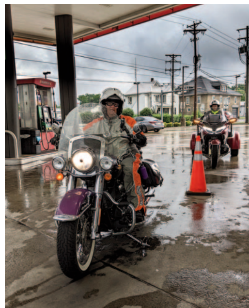
Then all too soon it was time for a 6-hour fretful ride/drive back east in torrential rain and flooding.